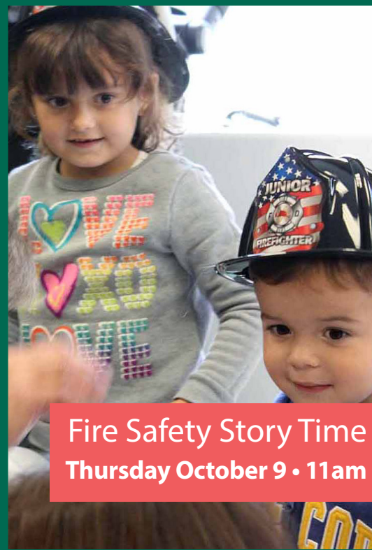
Fire Safety Story Time Thursday October 9 • 11am

Stop by the Children's Place and trick or treat in a safe, dry place. Costumes are optional, but fun is not! For ages 0-6 and families.