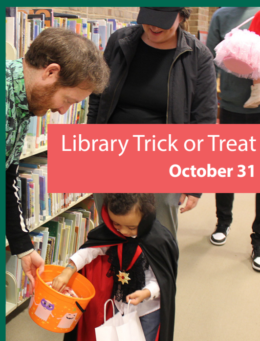
Library Trick or Treat October 31

All abilities are welcome. No signup is required unless noted, but space is limited and story times begin promptly. There may be a limited capacity for each session. When Bethlehem schools are closed or delayed, all story times are cancelled.