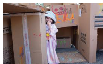
Cardboard fort Page 6