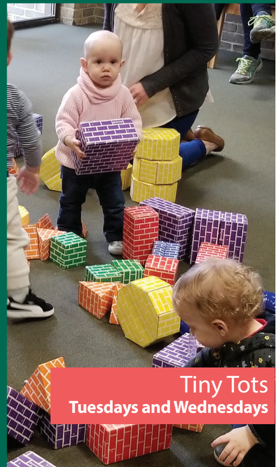
Tiny Tots Tuesdays and Wednesdays