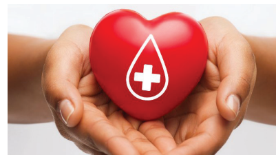
Red Cross blood drive Page 3