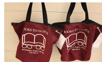
Books to People Page 8

451 Delaware Ave., Delmar • 518-439-9314