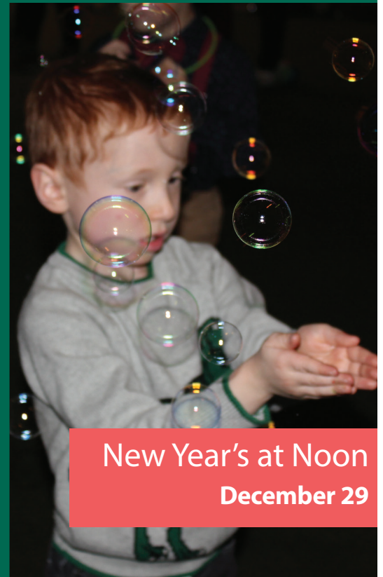
New Year's at Noon December 29

Singing slows down language so children can hear different parts of words and notice how they are alike and different.