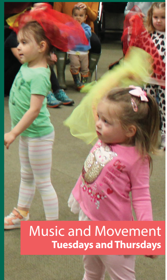
Music and Movement Tuesdays and Thursdays