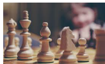
Chess Club Page 5