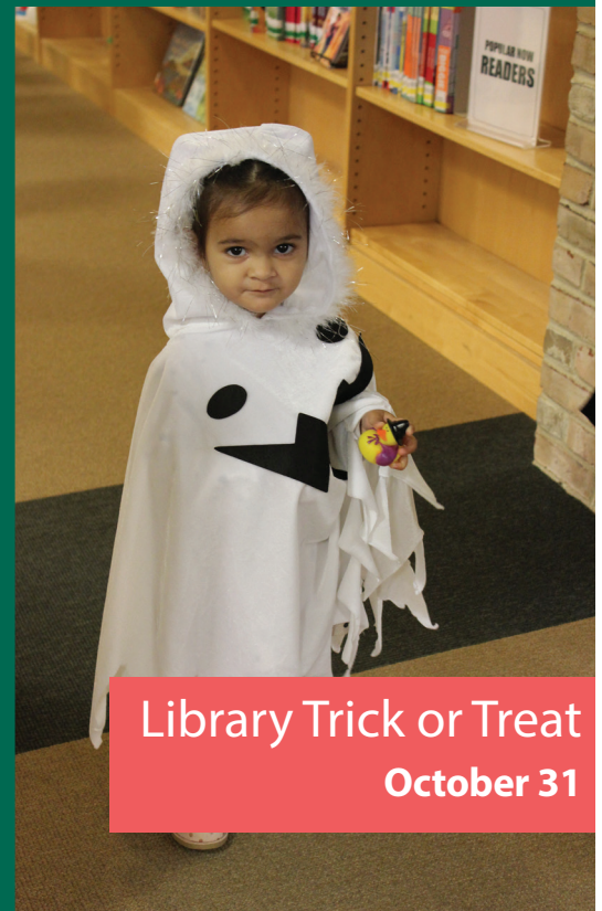
Library Trick or Treat October 31

Children learn more new words from books than they do from everyday conversation. Hearing less common words is important to developing their vocabulary.