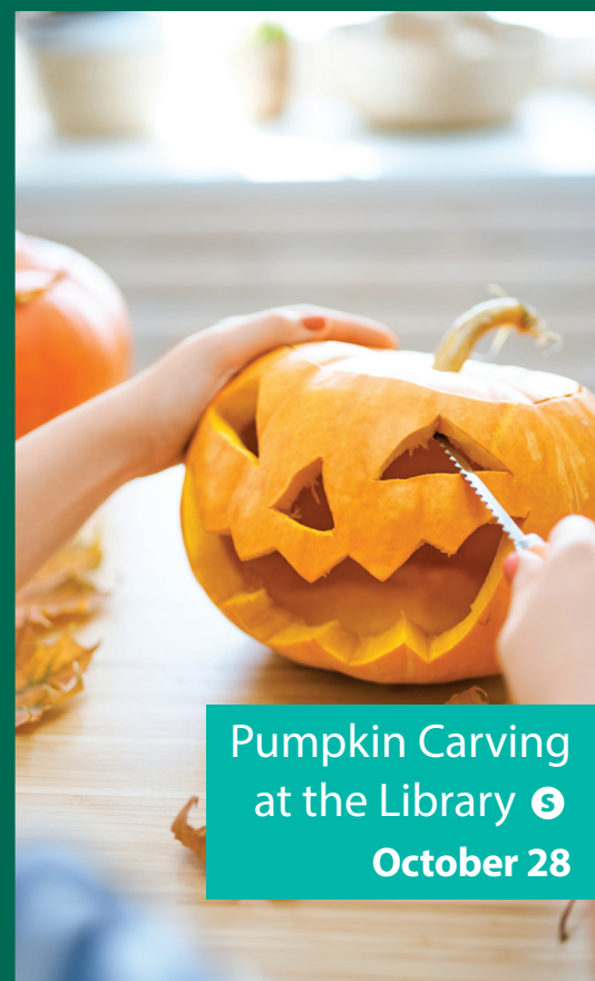
Pumpkin Carving at the Library S October 28