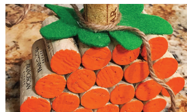
Cork pumpkins Page 4