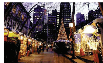
Friends Bus Trip to NYC Page 8