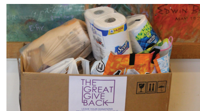
The Great Give Back Page 2