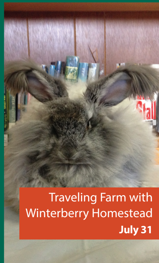
Traveling Farm with Winterberry Homestead July 31