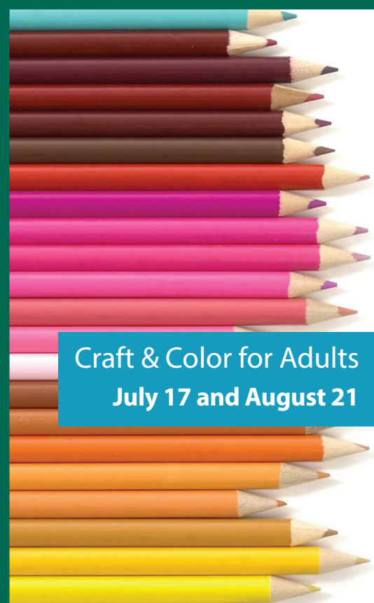
Craft & Color for Adults July 17 and August 21