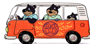
Library Expedition Page 8