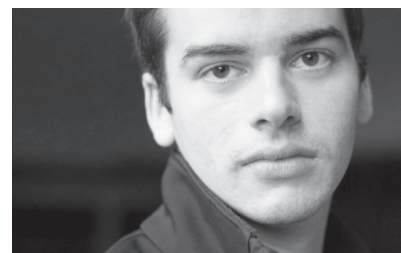
The Photographs of Brendan Fahy Bequette Page 3