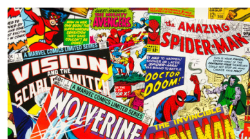
Comic Book Day Page 6