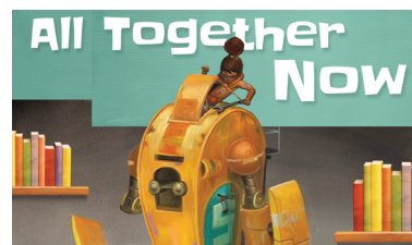
Summer Reading 2023 Page 5