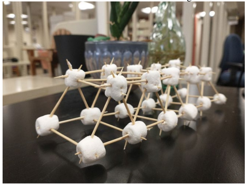
Slingerlands Elementary Afterschool Enrichment - 1/26 - Marshmallow Bridges

Slingerlands Elementary: After School Enrichment: Marshmallow Bridges - 1/26/23 Luke discussed load-bearing structures with the ASE group. We built bridges using marshmallows and toothpicks and tested their strength with weights. This was the second in a series of five STEAM-focused ASE events at Slingerlands. Attendance: 10