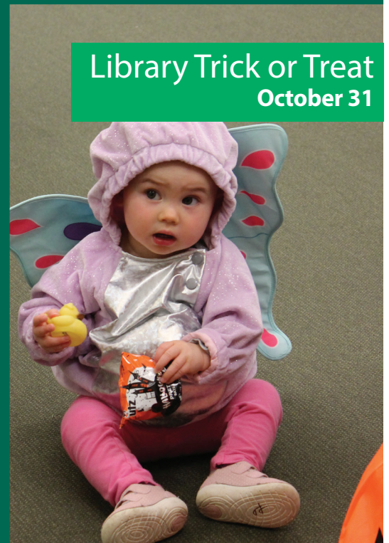
Library Trick or Treat October 31