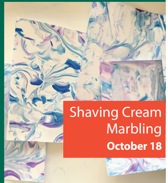
Shaving Cream Marbling October 18

Stop by the Children's Place any time from 10am-noon on Monday October 31 and trick or treat in a safe, dry place. Costumes are optional, but fun is not! Treat bags will be provided. For ages 0-6 and families.