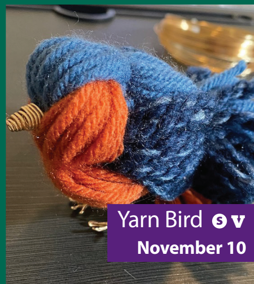
Yarn Bird S V November 10