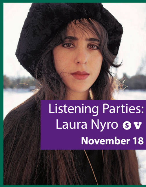
Listening Parties: Laura Nyro S V November 18