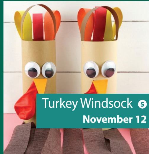
Turkey Windsock S November 12

S sign up: bethlehem.librarycalendar.com