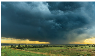
Forces of Nature Page 3