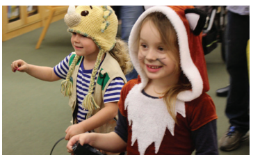
Library Trick or Treat Page 4