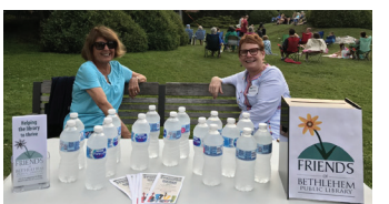
About the Friends Page 6

451 Delaware Ave., Delmar • 518-439-9314