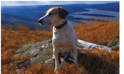
Doghiker with Alan Via Page 3