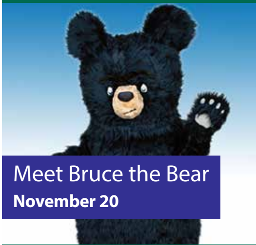
Meet Bruce the Bear November 20

Make a noisemaker and enjoy some bubbles and dancing as we count down to the new year at a more family-friendly hour!