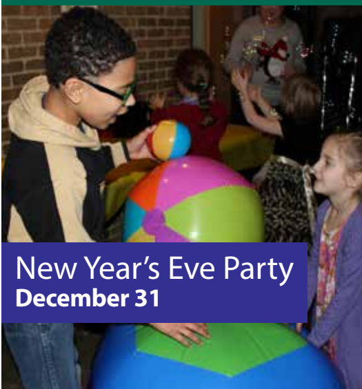
New Year's Eve Party December 31