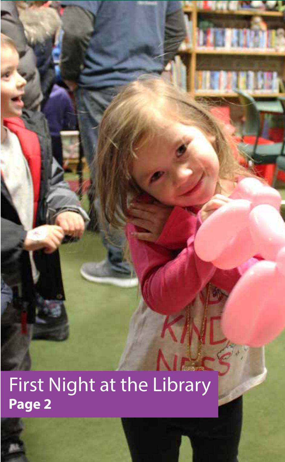
First Night at the Library Page 2