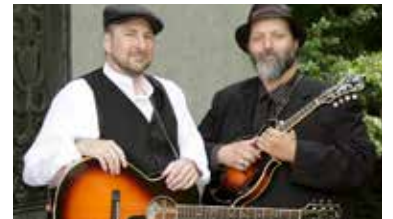
Lost Radio Rounders Page 3