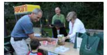
Meet the Friends Pages 10-11