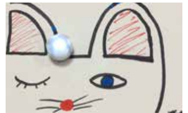
Hour of Code for Kids and Teens Page 6